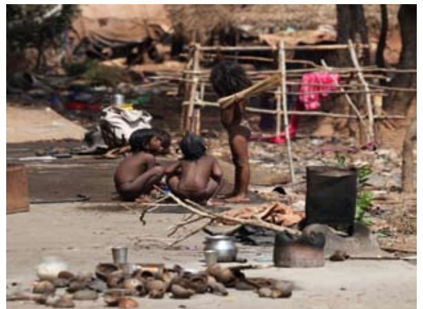
Children living and playing in a rubbish dump

Poverty is hunger. Poverty is losing a child to illness caused by lack of sanitation and dirty water. Poverty is lack of shelter. Poverty is being sick and not being able to see a doctor. Poverty is not having access to school and not knowing how to read. Poverty is not having a job. Poverty is fear for the future. Poverty is living one day at a time. Poverty is powerlessness. Poverty is lack of representation and freedom.