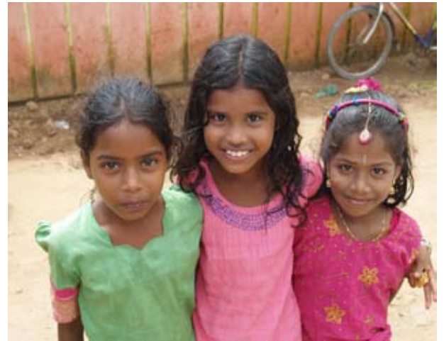
Children deserve a life and a future